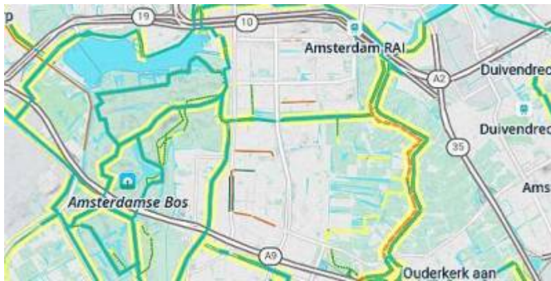
View Walkabout Bike